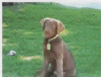
Precious puppy, Burt